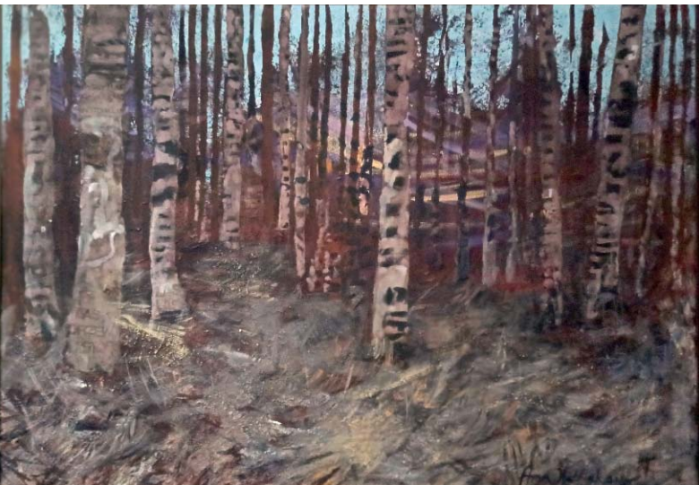
100x70 cm, acrylic on canvas, 2021