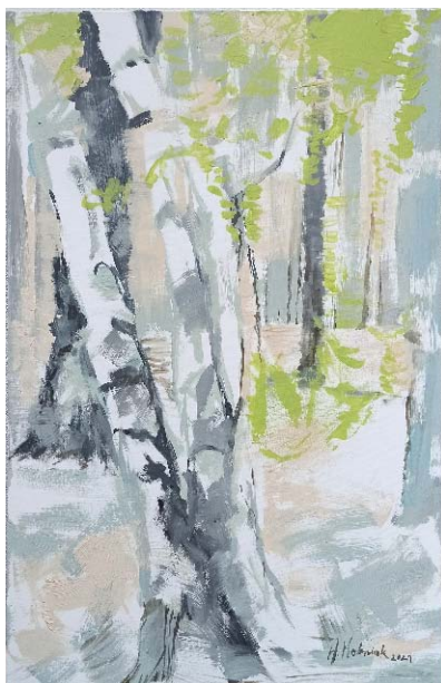
75x115 cm, acrylic on canvas, 2021