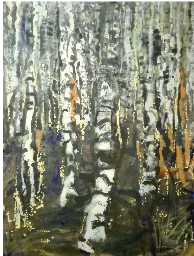
80x100 cm, acrylic on canvas, 2020

Private collection of „Birch Forrest" since 2020